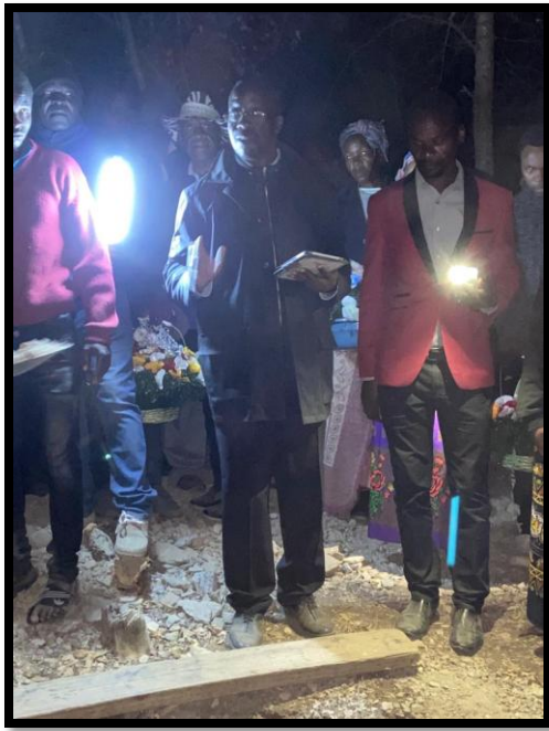
Funeral service at night