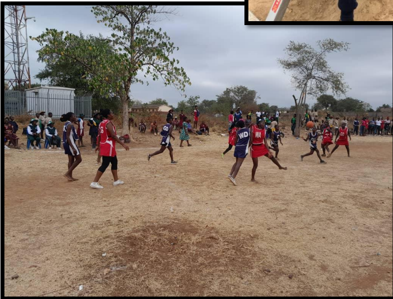
Christian School Competition